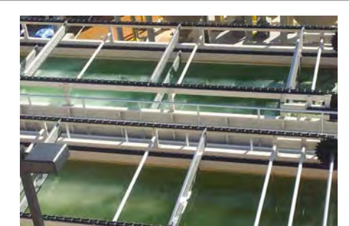
RECTANGULAR DISSOLVED AIR FLOTATION

Ideally suited for municipal applications including thickening and algae removal.