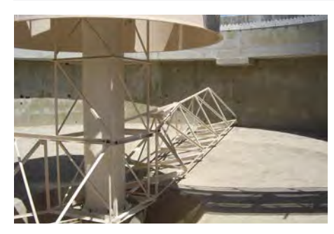
STANDARD SCRAPER CLARIFIERS

Standard scraper clarifiers are designed for all applications involving sludge removal.