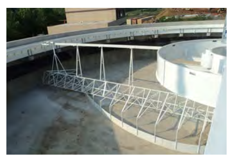
SPIRAL BLADE CLARIFIER SYSTEMS

Standard scraper clarifiers are designed for all applications involving sludge removal.