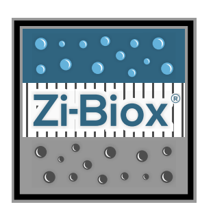
TREATMENT PLANT SOLUTIONS

Rotary distributors are used in industrial and municipal applications. All distributors are computer designed to provide a uniform flow distribution, high BOD removals and a stable effluent.