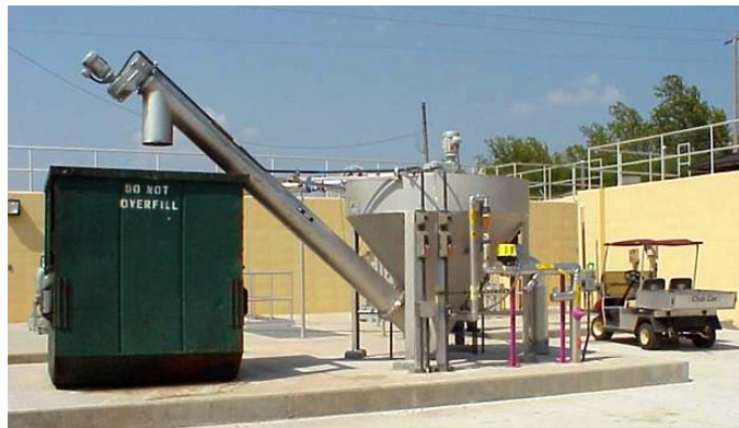
Grit Washer for exceptionally clean and dry grit.