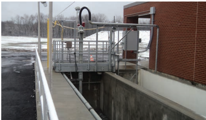
Bridges can be fitted with scrapers and/or pumps for grit removal.