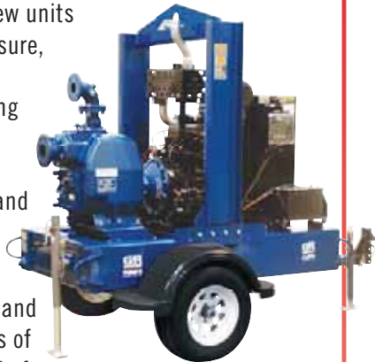
SHOWN WITH OPTIONAL WHEEL KIT

These pumps are powered either by an air-cooled diesel engine or a liquid-cooled diesel engine all of which meet the latest EPA Tier emission standards.