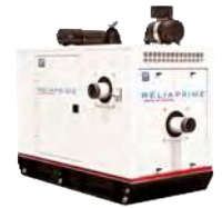
Super T Series® ReliaPrime® sound- attenuated back-up system