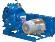
Super T Series® V-belt driven