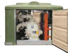
Super T Series® ReliaSource® packaged pumping station