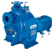
Super T Series® Close-coupled