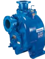
Super T Series® Size: 6" (150 mm) Shown with optional flanges