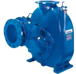
Super T Series® Size: 10" (250 mm)