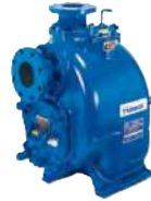
Super T Series® Size: 4" (100 mm) Shown with optional flanges