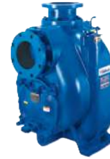
Super T Series® Size: 8" (200 mm) Shown with optional flanges