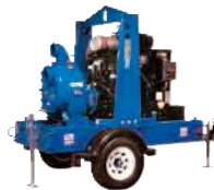
Super T Series® Engine driven Shown with optional wheel kit