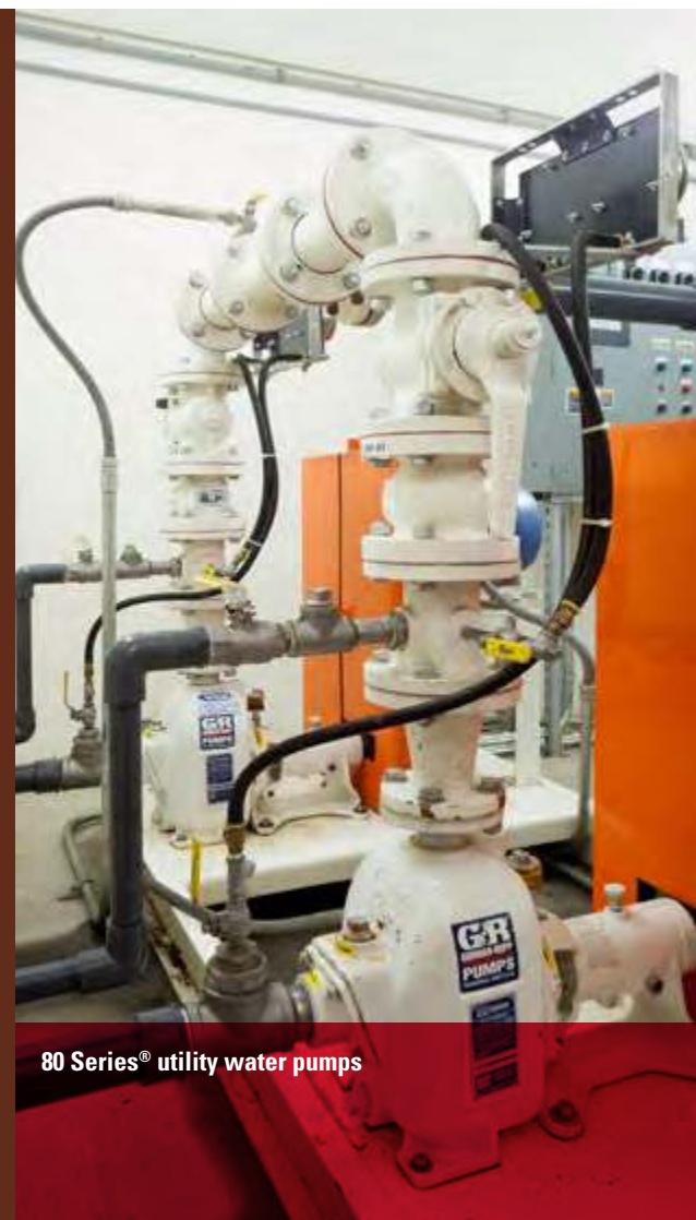
80 Series® utility water pumps

NOTE: Gorman-Rupp recognizes that the above treatment plant diagram will not apply for all municipalities and is meant for illustrative purposes only.