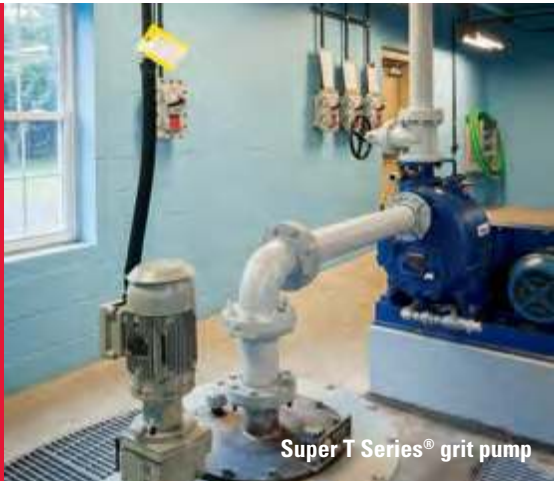
Super T Series® grit pump