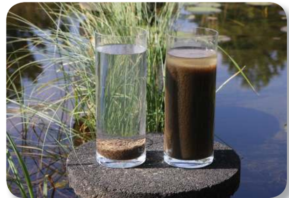
SVI5 comparison of aerobic granular sludge (left) and conventional activated sludge (right)