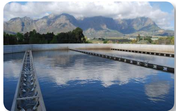
Treated effluent produced from an AquaNereda® reactor.