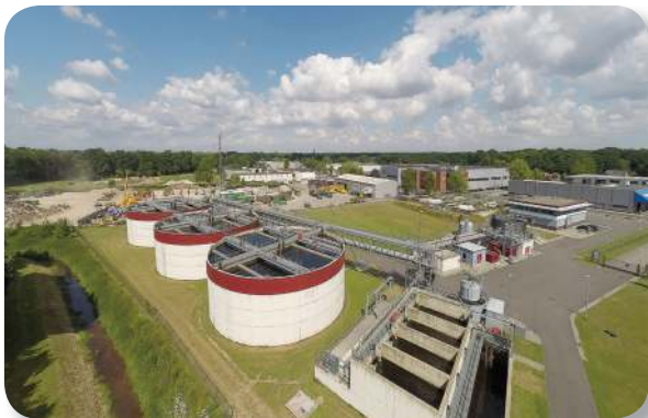
Three AquaNereda® reactors show compact design, typically 50% of a conventional plant.